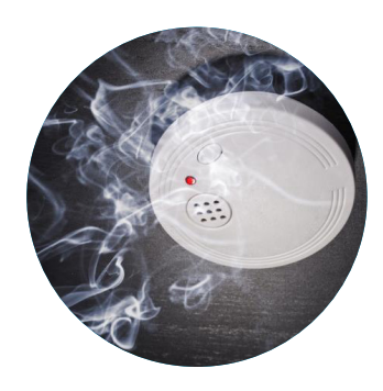
Fire alarm systems