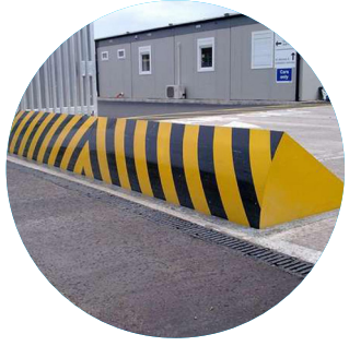
Barriers and Security Fenders