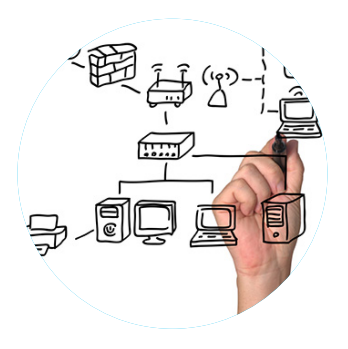
Designing and installing of wired and wireless networks