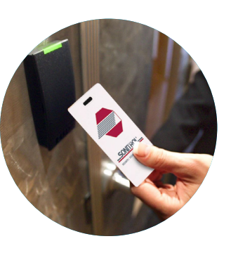
Access control systems