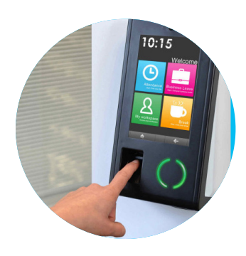
Attendance and departure systems