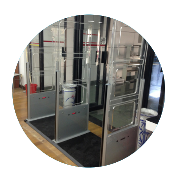
RFID anti-theft gates