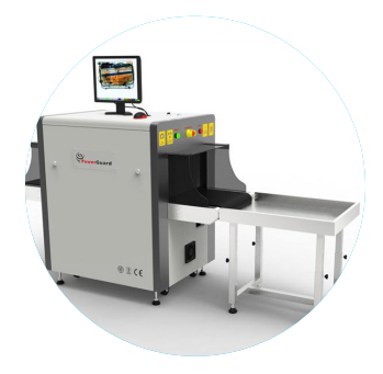
Metal Detectors systems