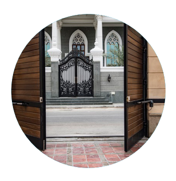
Supplying and installing automatic doors